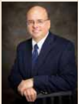
Hon. Grant Barrett