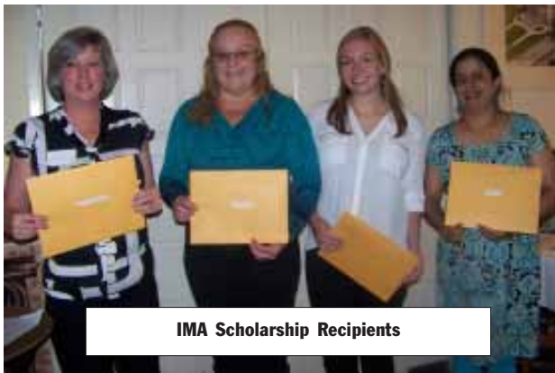
IMA Scholarship Recipients