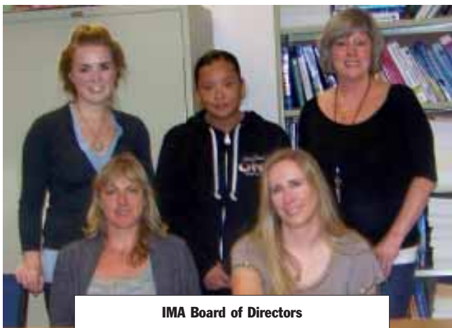
IMA Board of Directors