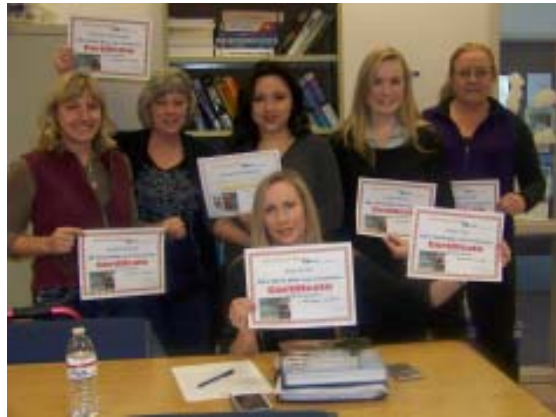
Left: Students are recognized for their fundraising efforts.