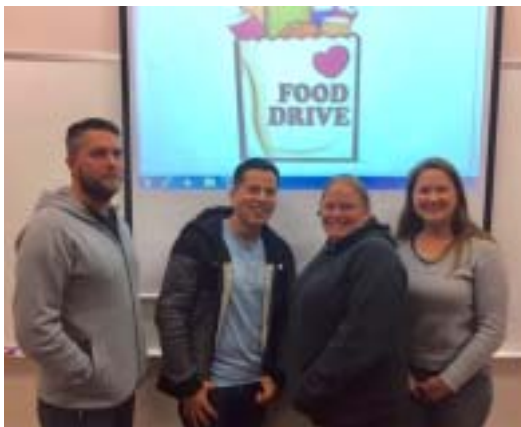
Below left: Students, faculty and staff participated in the Bite of Reality financial workshop at Ridgway High School.