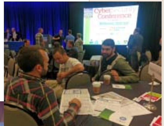
Above and left: Students learn from industry experts at security conferences.